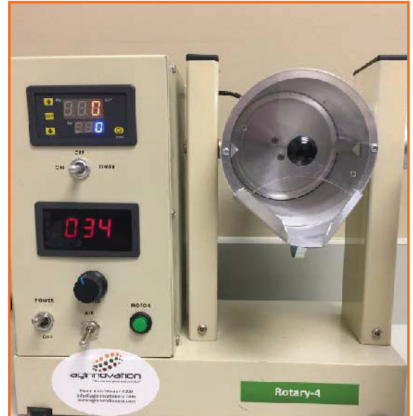
Empty positioning with chute / seed packet holder.